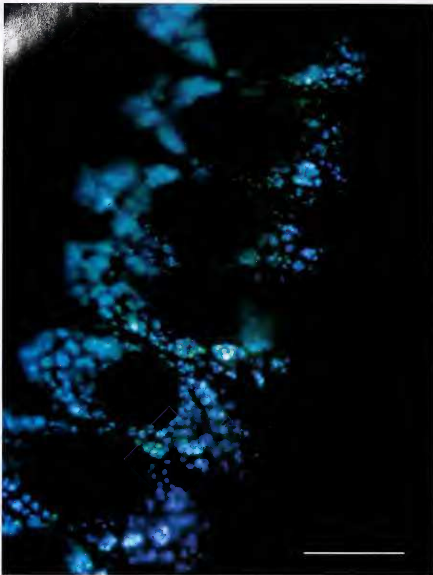
Figure 6. Epifluorescence micrograph of the oral surface of an arm tip of Vampyroteuthis infernalis , showing patches of clustered particles. The dark areas along the midline are in the central plates, which bear suckers or their rudiments. Scale bar = 1 mm. Individual particles ranged from 10 to 15 \mu\text{m} in greatest dimension.

dermal organs of Vampyroteuthis , but we have never seen the latter luminesce.